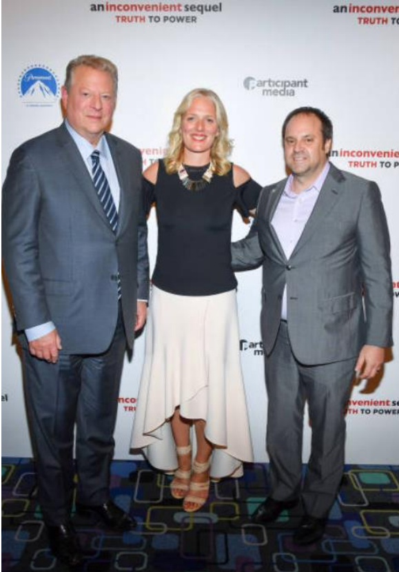
Right to Left: Al Gore, Catherine McKenna, Jeff Skoll attending a special Toronto screening of “An Inconvenient Sequel: Truth to Power” at Cineplex Scotiabank Theatre July 21, 2017 in Toronto, Ontario

Catherine McKenna | World Economic Forum